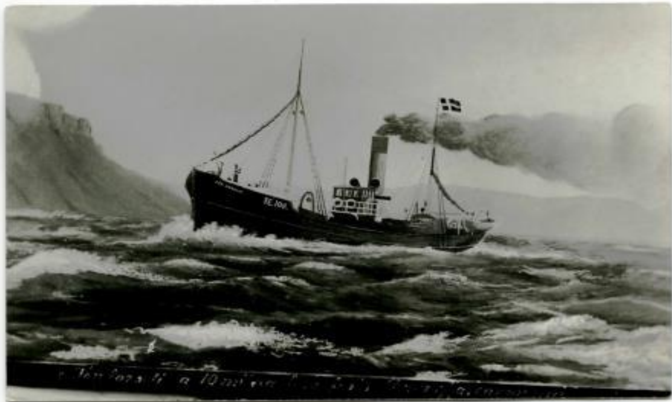
Il tempo di a 10 mi. in ...